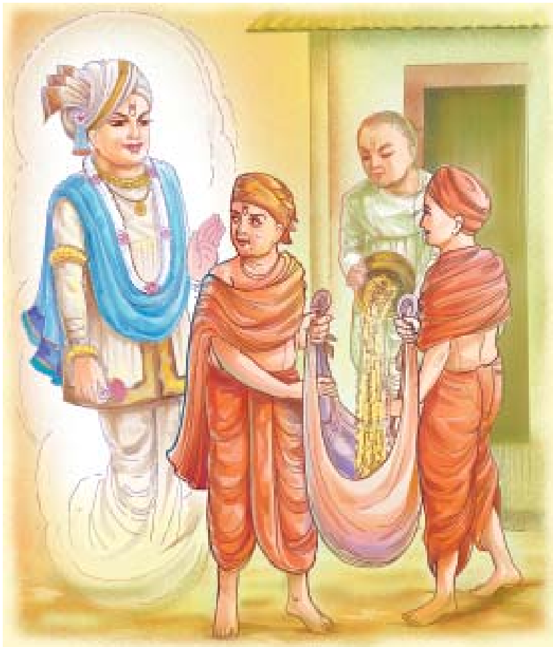
“How can I show my back to a sadhu like you?”

Once, while they were collecting alms, Anand Swami also witnessed Swami's constant focus on the