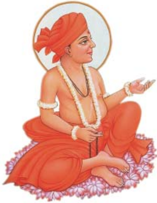
Aksharbrahma Gunatitanand Swami