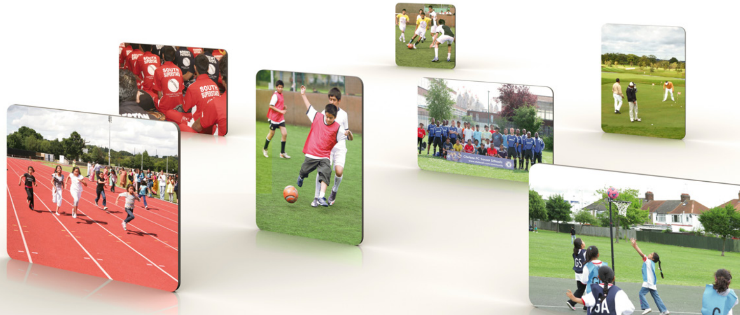
(Opp) Twenty20 Cricket Tournament; 08.08.09 (L-R) Family Sports Day, Barnet Copthall Stadium; 12.07.09 | U23s 8-a-side Cricket Tournament; 03.10.09 | U14s 5-a-side Football Tournament; 11.07.09 | U23s 5-a-side Football Tournament; 18.07.09 | Chelsea FC Asian Recruitment Programme; 14.06.09 | U13s Netball Tournament; 11.07.09 | Charity Golf Day; 03.09.09

These events also help to pass on some of life's most valuable lessons. Participants learn the value of discipline, teamwork and individual responsibility, as well as to accept both defeat and victory with grace and humility.