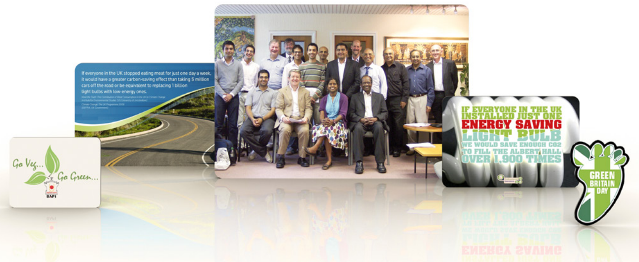
(Right & far right) Public awareness poster campaign for World Environment Day and Green Britain Day; 05.06.09 & 10.07.09